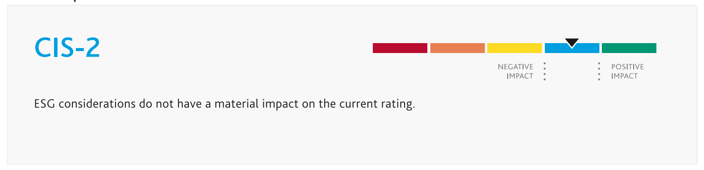
Exhibit 4 ESG credit impact score

Macquarie Bank Limited's ESG credit impact score is CIS-2