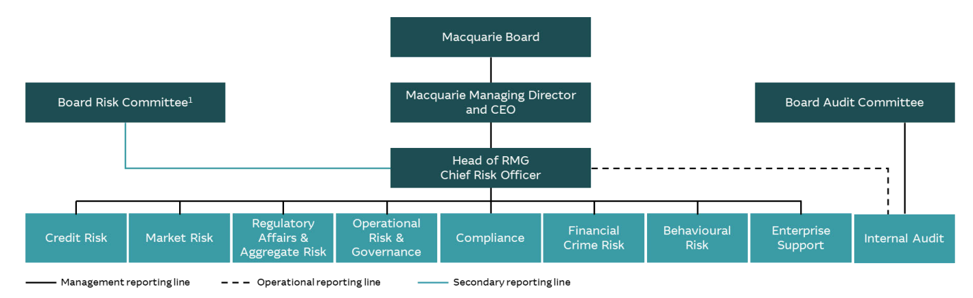
1. The Board Risk Committee assists the Board by providing oversight of Macquarie's risk management framework and advising the Board on Macquarie's risk appetite, risk culture and risk management strategy. In addition, the Board Governance and Compliance risk framework of Macquarie, including the conduct risk management framework, and reviews and monitors Macquarie's work health and safety, environmental and social risk management policies and customer and client reporting.

RMG is structured into specialist functional divisions, depicted below, and employs an integrated approach to risk analysis and management across risk classes. RMG's assessment and monitoring of risks involves a collaborative effort across the divisions to ensure a detailed analysis takes place both at the individual and aggregate risk level. Effective risk management is a function of both rigorous processes and the ability of experienced professionals to provide new perspectives on the risks they are considering. RMG attracts high calibre candidates. It recruits experienced individuals both from within Macquarie and externally.