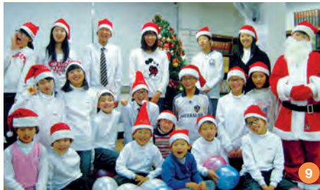
Some of the 24 children at Aehyangwon orphanage who will benefit from improved facilities.