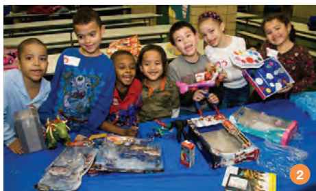
Some of the children who benefited from the New York Cares Winter Wishes drive.

1 One of the Haitian disaster relief charities staff donated to was the Red Cross – providing clean drinking water was one of the many services the aid organisation established following the earthquake.