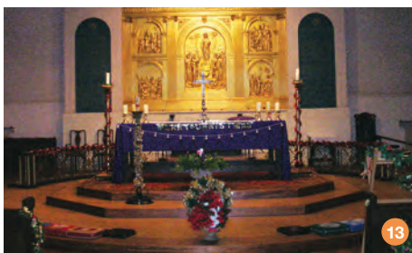
Hackney church's festive decorations, courtesy of some of MacCap's Industrials team.