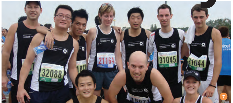
The HK team pounded pavements to raise close to $HK23,000 for UNICEF.