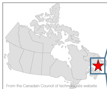
Magdalen Basin, Gulf Of St. Lawrence, Canada Map